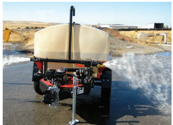
Full left/right 2" discharge demonstrated.